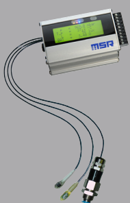
MSR255 with ext. sensors